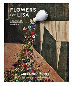
File size : 293284 KB Print length : 144 pages Lending : Enabled