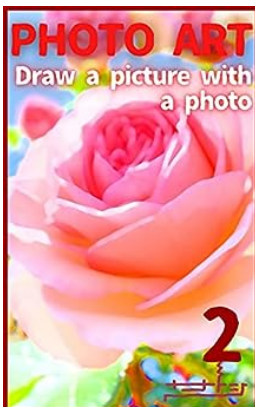
Photo Art Draw Picture With Photo: A Captivating Way to Bring Your Photos to Life